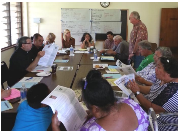
FACE leaders gathered at St. Anthony Church in Wailuku Saturday, May 17 for another planning and strategy session. Members from 11 FACE units attended this meeting, as well as developers. This meeting resulted in FACE's formal position paper on the Ordinance.